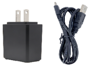
Fast charge adapter and CtoC data cable